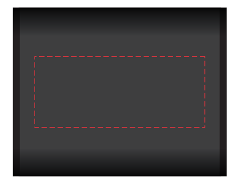
Left Side Branding: 60 x 25 mm (w x h) 4CP Digital Print Pad Print