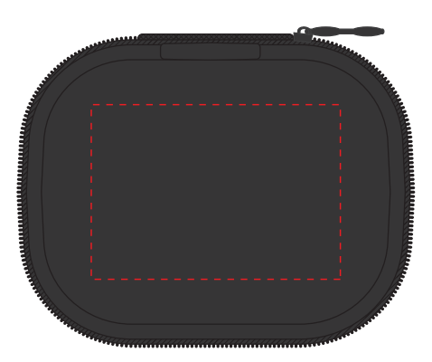
Zippered Case Top (@ 75%) Branding: 50mm x 35mm Pad Print (1 Colour Only)

Please follow these artwork guidelines • Use and supply vector-based artwork • Illustrator compatible EPS or PDF with all fonts outlined • Indicate any necessary colour details with the correct PMS colour • All Pantone colours need to be supplied as Pantone Coated (PMS C) colours • All specifics need to be "embedded" in the file, i.e. no linked artwork should be provided • Bleed is crucial when printing edge to edge. Artwork must extend beyond the finished and trim size dimensions.