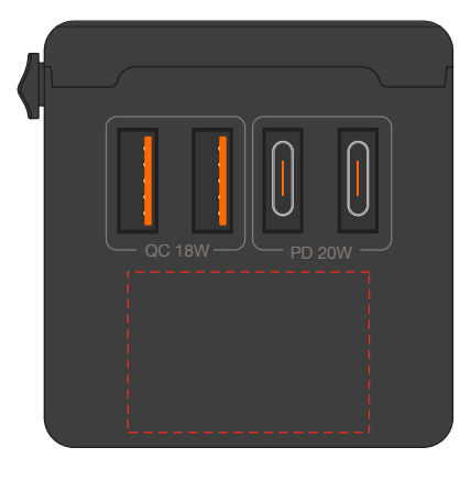
Bottom Branding: 30 x 20 mm (w x h) 4CP Digital Print or Pad Print