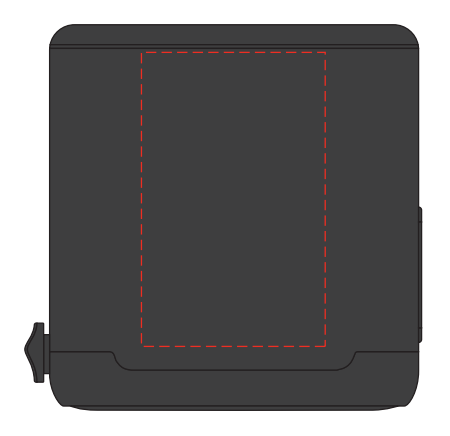
Top Branding : 25 x 40 mm (w x h) 4CP Digital Print or Pad Print