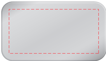
Aluminium Plate Size: 46.5 x 26.5 mm